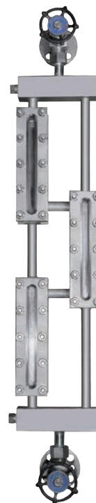
Model : L220 (Transparent type)